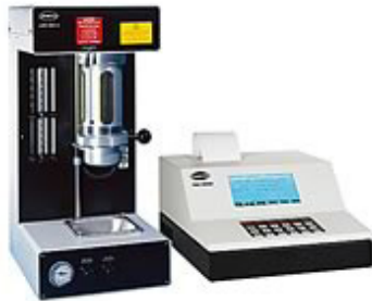
HIAC ROYCO 8011 OPC