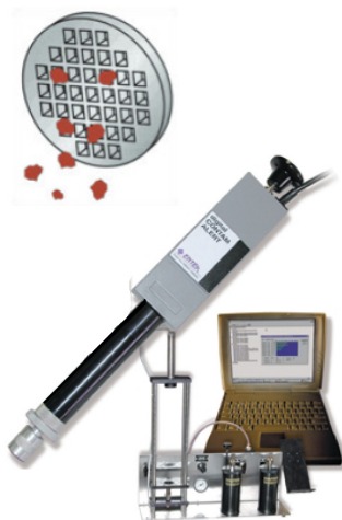
Rockwell digital CONTAM-ALERT