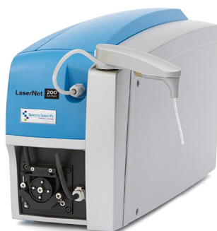
LaserNet 200 Series