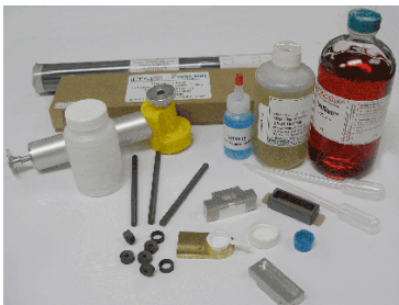
Oil Analysis Consumables